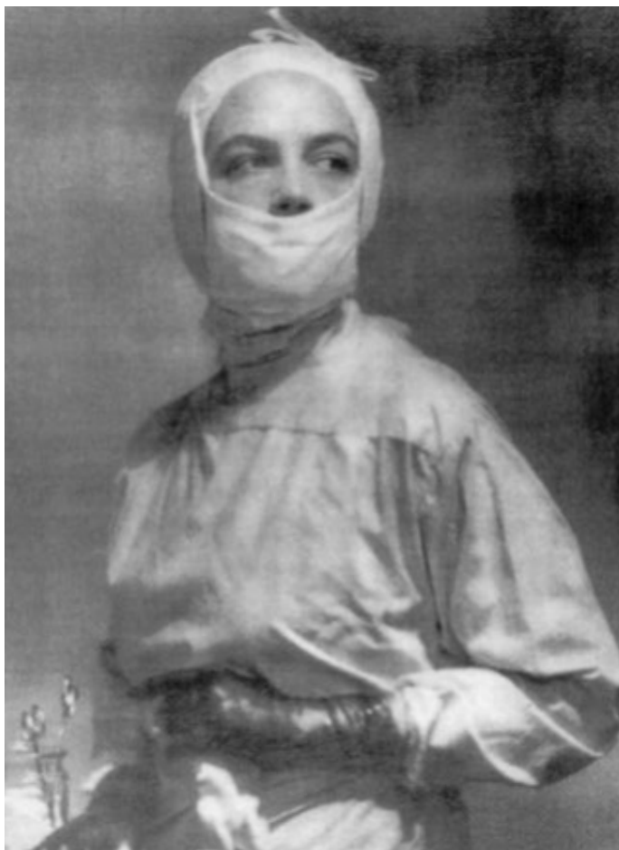
The theatre sister (c.1948) from the Fifty masterpieces of photography portfolio (1930s, printed c. 1948).