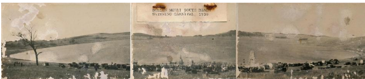
Bullen Merri South Beach Swimming Carnival, 1930