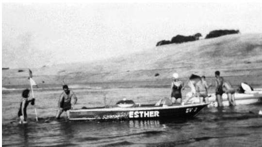
The boat "Esther" belonged to Arch Ferguson from Boorcan. It was a clinker boat with an Everingham V8 Side Valve Engine.