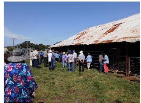
Outside the old Rabbit Factory

Established in the old woolshed on the property in 1885, in its first season, the factory produced 186,000 cans for export ‘each tin weighing 2 lb., containing a rabbit and three quarters’. The skins were dried and exported as well. More than 50 men and boys were employed in the factory, supplied by 150 trappers. The factory is believed to have operated until about 1895.