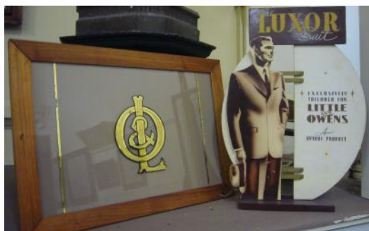
The window from Little & Owens shop and an advertisement for "The Luxor Suit, Exclusively tailored for Little & Owens. A HITONE PRODUCT" c.1950