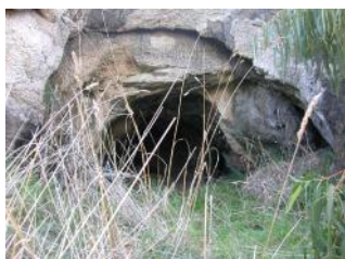
Lava Tube cave which was used for boat storage is now many metres from the shore.

On Saturday the Camperdown Swimming Club will hold aquatic sports at the park side of the lake. A most attractive programme has been arranged and a special feature of the events will be the demonstration of life-saving to be given by members of a Melbourne club. It is to be hoped that the success of the carnival will exceed all expectations, and that the money to erect an additional dressing shed will be readily forthcoming. Both sides of the lake have their partisans but anything to improve the bathing facilities of the lake generally should be encouraged and supported by all.