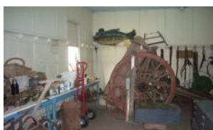
The old supper room. Still work to be done here!

The Corangamite Shire owns the building and it has proved difficult to get building maintenance carried out. A supper room was added to the back of the hall about 115 years ago. This was of timber construction and has deteriorated to the extent that it now leaks when it rains. This room is the storage area for many of the larger exhibits owned by the Society. One such exhibit, an oat threshing machine, is considered of State importance due to its links with Victoria's early pastoral and agricultural industries, the mechanisation of work on large farms and the development of Melbourne's early manufacturing industry. This machine, and all