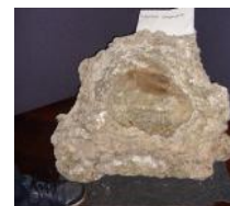
On display at Heritage Centre.

A rock formed of sediments deposited during the evaporation of lake water, spring water, or groundwater. Tufa is usually composed of calcium carbonate.