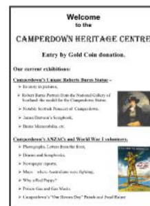
Exhibitions for WW1 and Robt. Burns- April to July'15