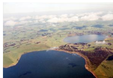
Aerial photo of the lakes - 2002