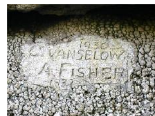
Owners' name plate at top of the cave entrance.

The lava tube cave which was used for boat storage back in the 1930s is now accessible just a few metres down from the road leading to the Camperdown Golf Course.