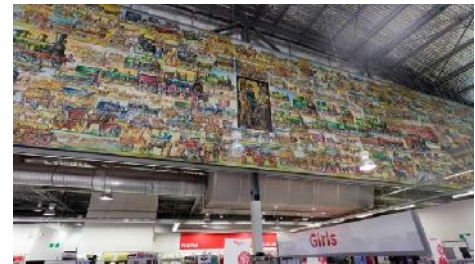
Some of our older members will remember this wonderful mural of Transport Through the Ages.

We completed our rather long day with something to eat in the Food Court and then staggered onto the train at ten to seven. We managed to stay awake by sharing many anecdotes, crossword puzzles, and laughs, finally arriving at Camperdown Station around 10pm. Phew!