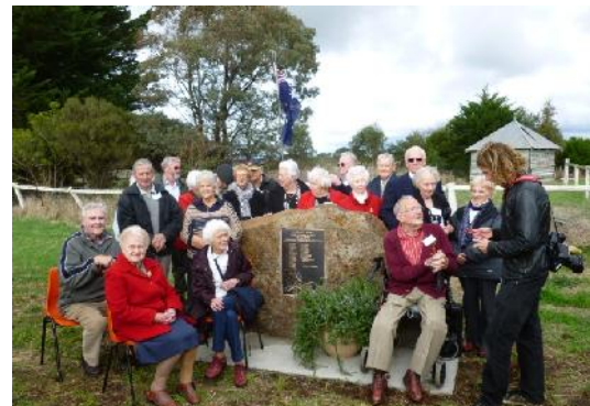
Unveiling of Memorial Plaque at the site of the of Chocolyn School - 6/5/2012

It mainly relates to the McErvale family who settled at Chocolyn in 1910 but it also includes a picture of life in the area from 1910-1950s. It includes the school, the hall and the Polio outbreak in 1935. It is a very interesting read.