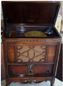
A 1925 Brunswick 'Panatrope'

In contrast to the earlier opening of the old Mechanics' Hall, instead of a live performance, the main attraction was a Cecil B de Mille movie, "The Volga Boatman". This was introduced by the Camperdown Theatre Orchestra which played "a selection of operatic classics and popular airs". From then on, the theatre became the hub of social and cultural activities for the district.