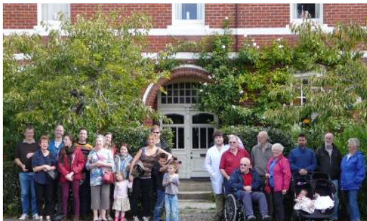
Group outside 15 Church St. It was run by the Walter family as a Working Men's Hostel in the 30s. They also, at one stage, had the Casino Café.

There were about six people from the Perrett family in the afternoon. The second lot said that they had 'run into' the first group a couple of times as they made their separate ways around the town. Both groups were having a wonderful time catching up with each other, finding old buildings lived in by their various ancestors and relatives, taking photos and telling us all about it!!