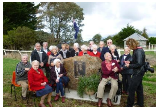
Unveiling of Memorial Plaque at the site of the of Chocolyn School - 6/5/2012

It mainly relates to the McErvale family who settled at Chocolyn in 1910 but it also includes a picture of life in the area from 1910-1950s. It includes the school, the hall and the Polio outbreak in 1935. It is a very interesting read.